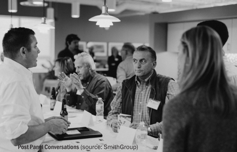
Post Panel Conversations

we have a large group of volunteer activists that can physically and vocally spread the word on the importance of the integration of natural systems within our communities and the multitude of benefits these spaces can bring to recreate, gather or to simply take a break from our hectic lives. The local connection must start first – and to reach the majority of our current population – this needs to start within our urban centers.