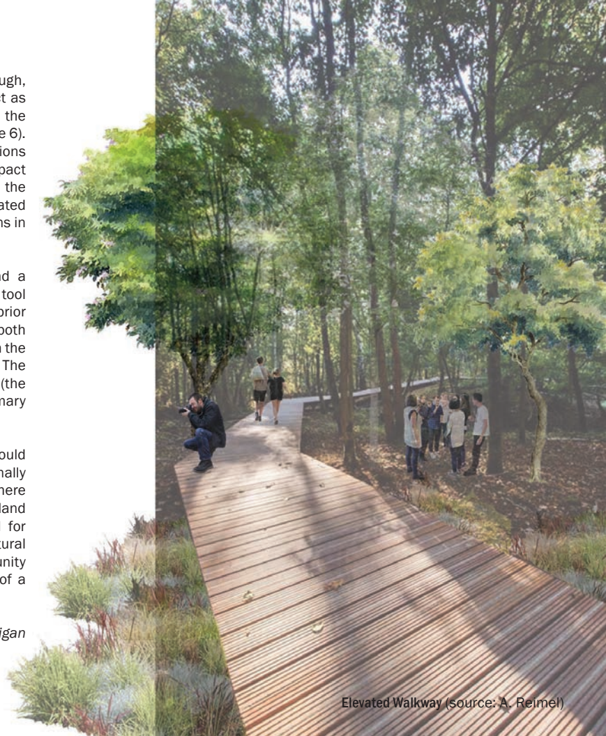
Elevated Walkway