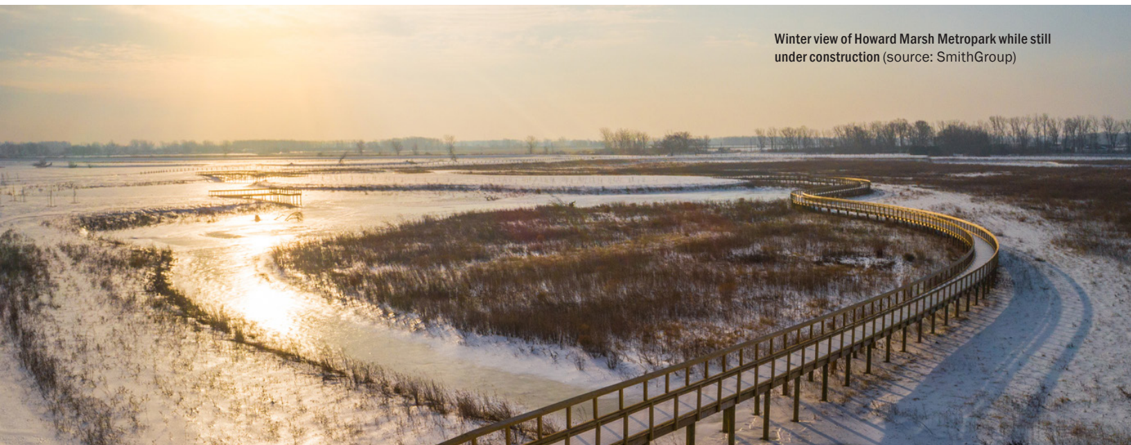
Winter view of Howard Marsh Metropark while still under construction

Contact: emily.mckinnon@smithgroup.com or (734) 669-2733.