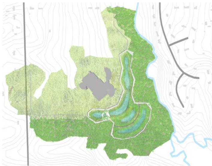
Site Master Plan

Following our initial site visit I continued the inventory and analysis with a fellow student where we began identifying a series of opportunities and constraints spanning the site. We began by locating the site using the GIS files offered by Washtenaw County in conjunction with regional data provided by