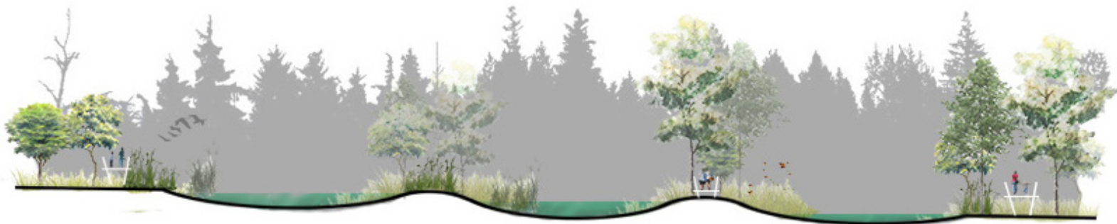
Wetland & Infiltration Cross-Section

to the Border to Border Trail system improving public connections to Downtown Dexter. Surrounding the site is primarily single-family residential and agricultural land uses allowing us to address the impacts of runoff from those environments in addition to the runoff from the school site. The extensive wetlands and potential for flooding on the site proved to be a challenge for any development including that of the proposed recreation fields. Another major constraint was the precipitately defined locations of the fields, and initial over-clearing of the site.