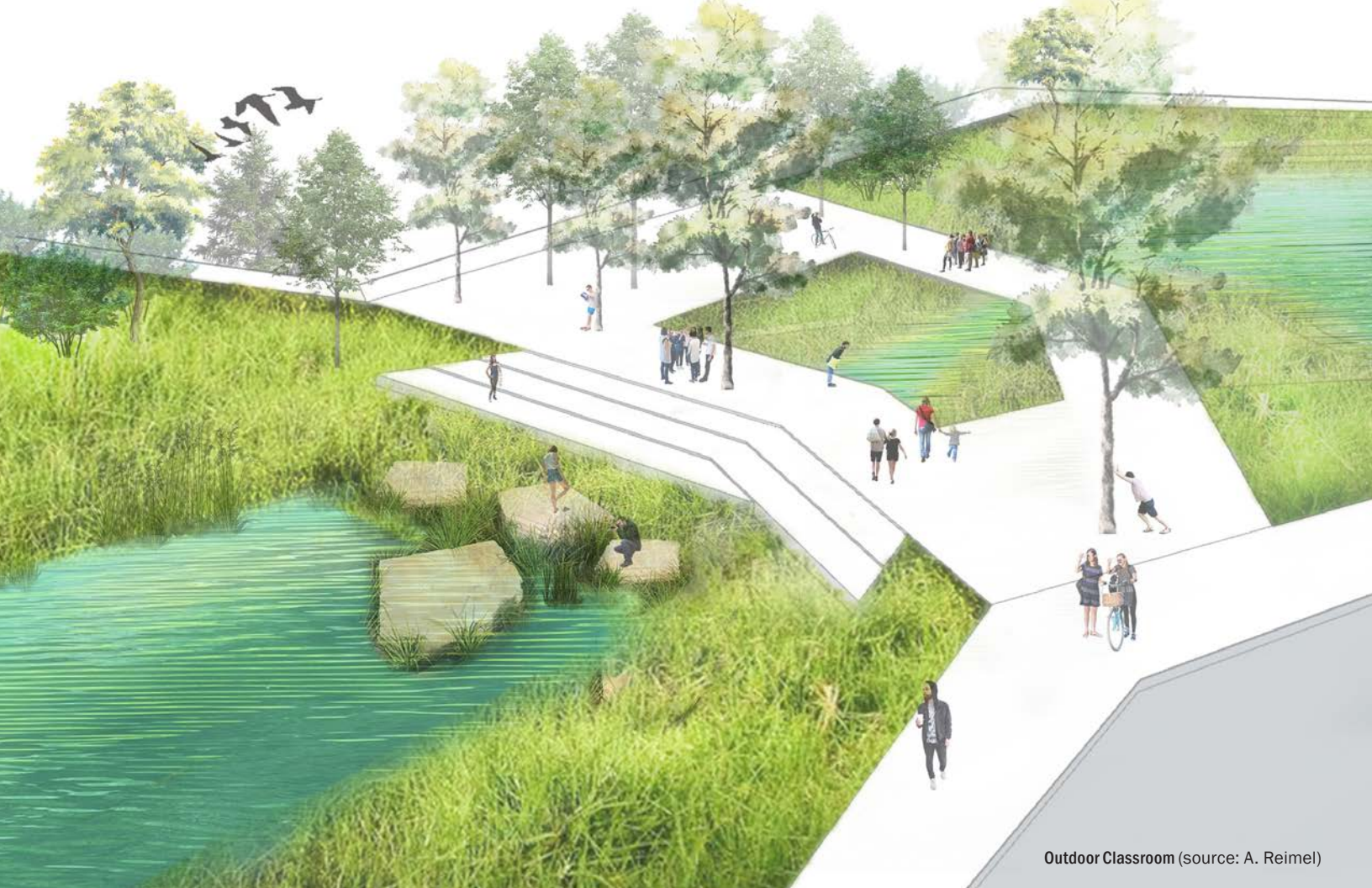
Outdoor Classroom